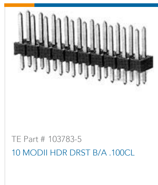
TE Part # 103783-5 10 MODII HDR DRST B/A .100CL