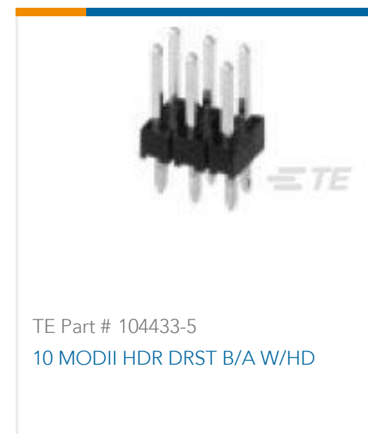
TE Part # 104433-5 10 MODII HDR DRST B/A W/HD