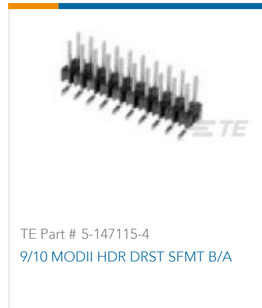
TE Part # 5-147115-4 9/10 MODII HDR DRST SFMT B/A