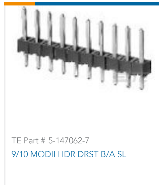
TE Part # 5-147062-7 9/10 MODII HDR DRST B/A SL