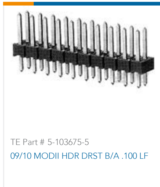
TE Part # 5-103675-5 09/10 MODII HDR DRST B/A .100 LF