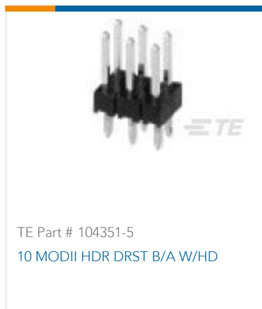
TE Part # 104351-5 10 MODII HDR DRST B/A W/HD