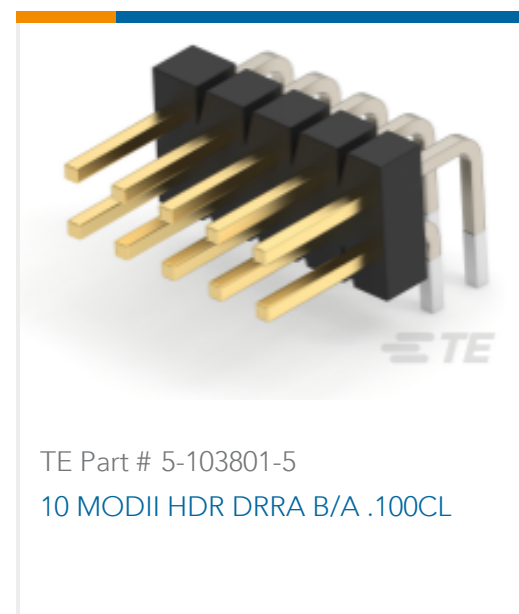
TE Part # 5-103801-5 10 MODII HDR DRRA B/A .100CL